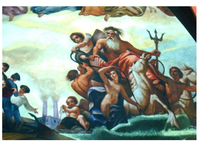
Above, a close-up of the Apotheosis of George Washington as it appears in a model of the Capitol Dome inside the CVC Exhibition Hall. Multiple photographs of Brumidi's masterpiece were pieced together to create the smaller scale replica.

At left, CVC workers inspect a waterproofing membrane that was applied last week around the north skylight. Two interior pedestal walls that surround the skylight will support a field of black granite stone. A thin pool of water will emerge between gaps in the stone and cascade over a drip edge before reaching the skylight glass or the outer seatwall.