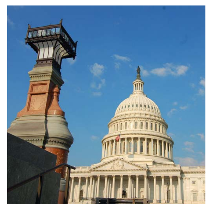
Historic preservation crews recently installed six bronze and glass light fixtures that sit atop 14-foot-high granite bases. The lanterns, which were designed by Frederick Law Omsted and installed in the 1870s, are back in their original Plaza locations.